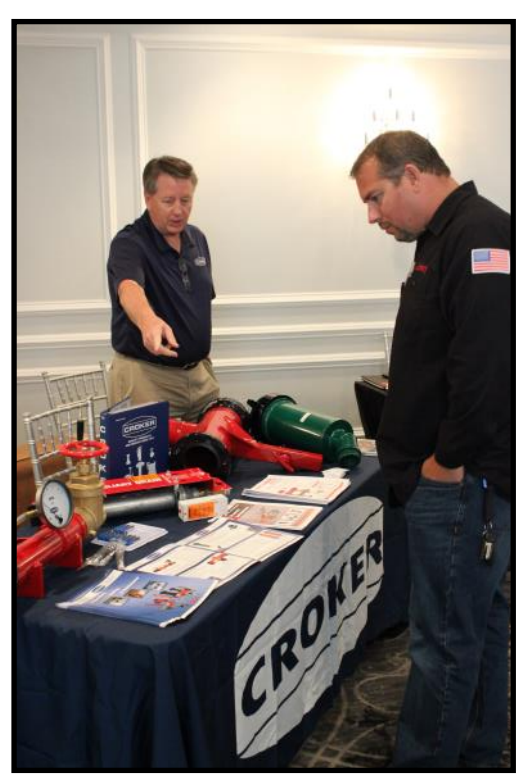
Croker, new testing equipment company.