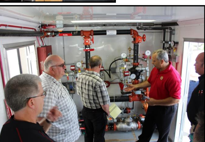
Above, trailer tours and demo.